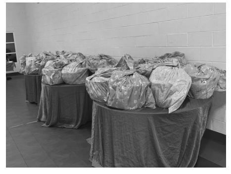
Each mother received a gender-specific gift basket

At the February 19th, 2019 Maryland Board of Directors Meeting, everyone was encouraged to bring baby shower gifts for military wives in the area. Many of these military families are stationed in other locations far away from family and friends. As such, they don't have people to help them, both financially and emotionally. These gifts were an effort to show the ladies that we appreciate the sacrifices they make. Clubwomen responded enthusiastically to this program by donating approximately $4,600 in gifts.