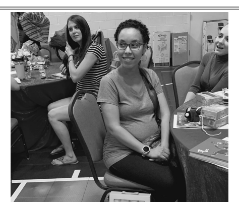
This mother is expecting her first girl after four boys