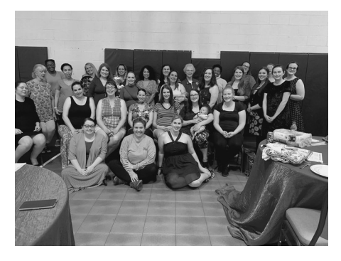
All of the expecting mothers in attendance at the baby shower