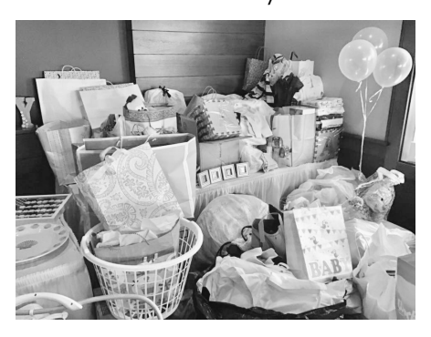
A sampling of the many donations received for the baby shower