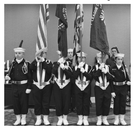
U.S. Naval Sea Cadet Honor Guard presenting the flag at the opening of the 120th Annual Convention