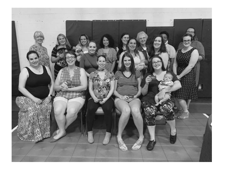
Mothers received gift cards for their older children

To follow up, Dottie Gregg and Carol Feser attended the baby shower held on May 2. The expecting mothers received gift cards for their older children. Everyone received a large basket of gender-specific items as well as other gifts.