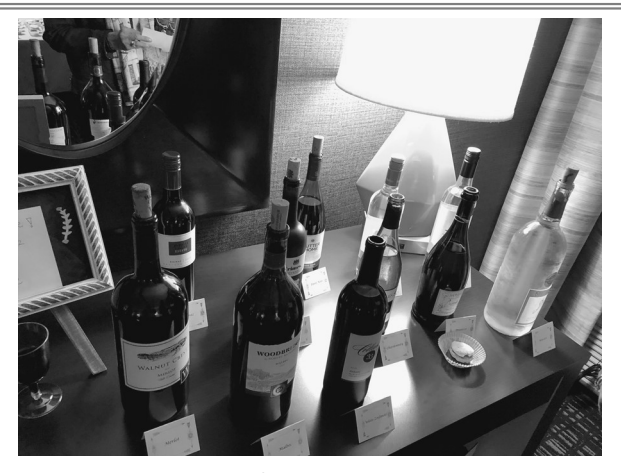
The sampling of wine at the wine tasting fundraiser