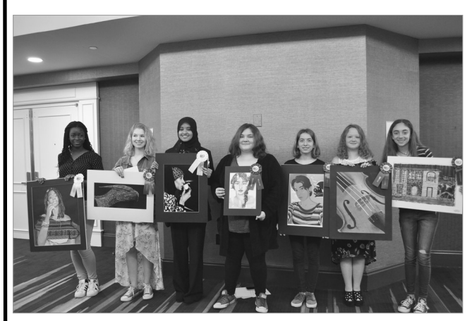
Youth Art Competition winners at the Maryland Convention